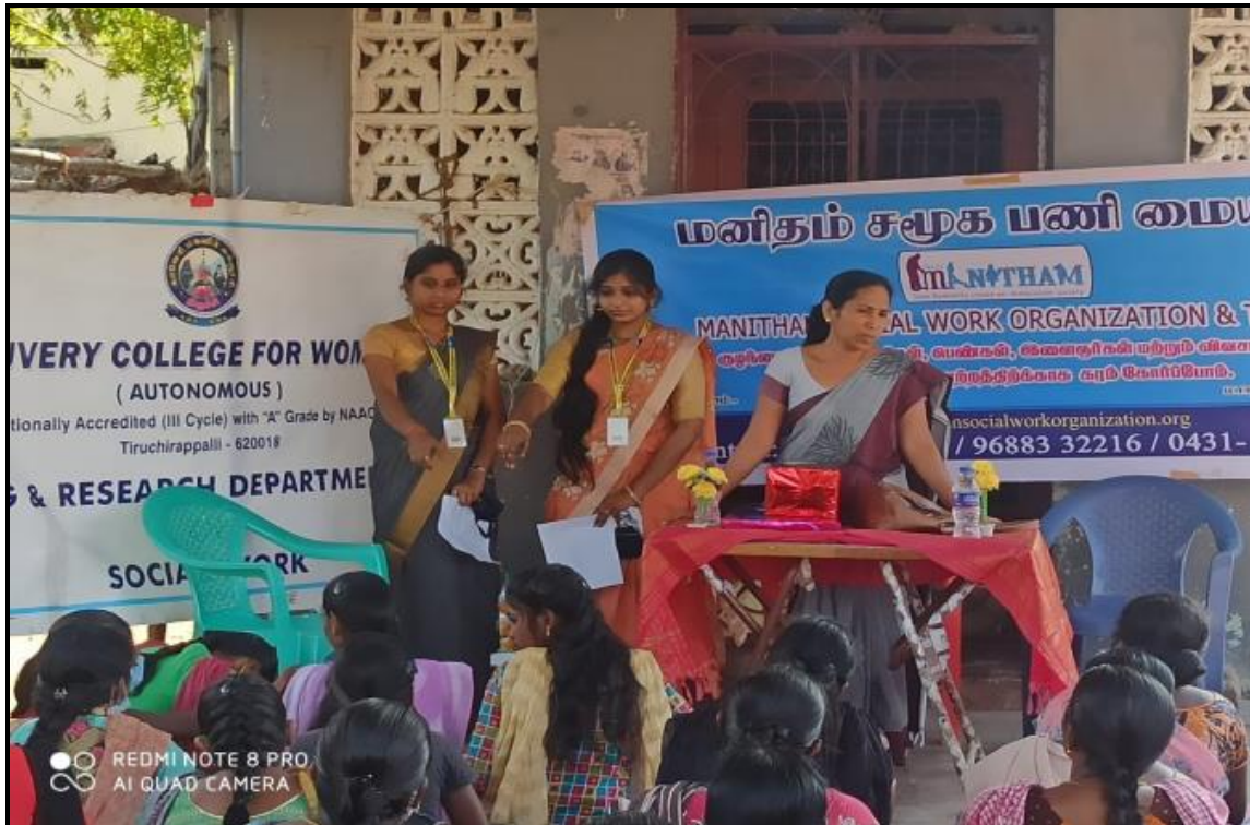
Awareness Programme on Alcohol Conducted on 16.02.2021