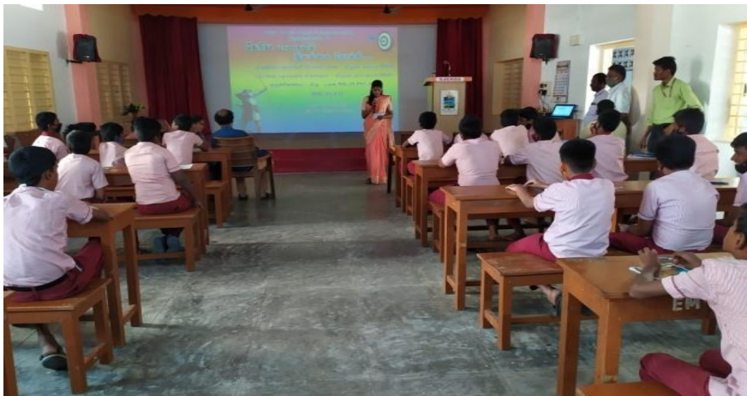
Educational Awareness Programme on They too Can conducted on 18.03.2021, by ASHA Deepam Special School, Trichy