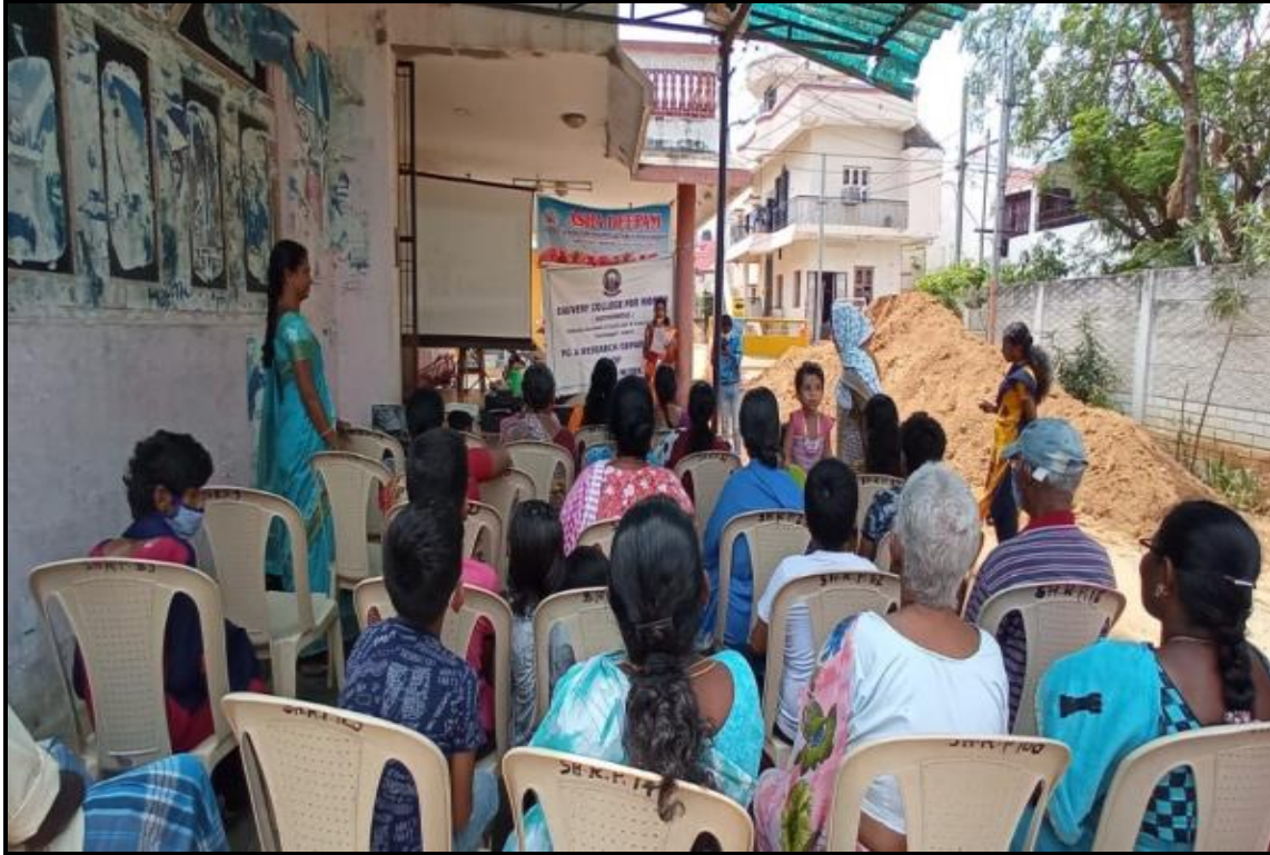
Awareness Programme on Menstrual Hygiene Conducted on 18.03.2021