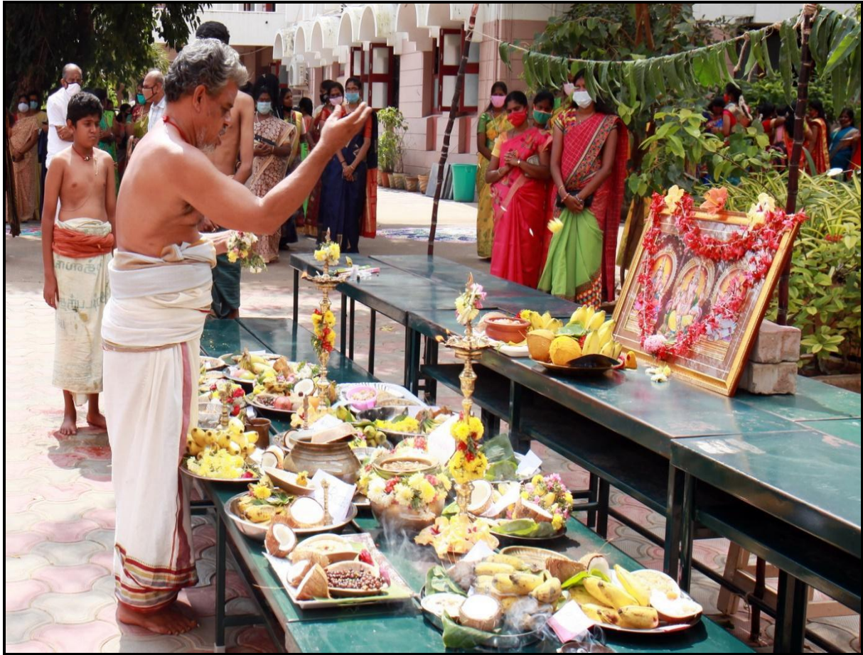
Pooja on Pongal Day celebration on 22.01.2021