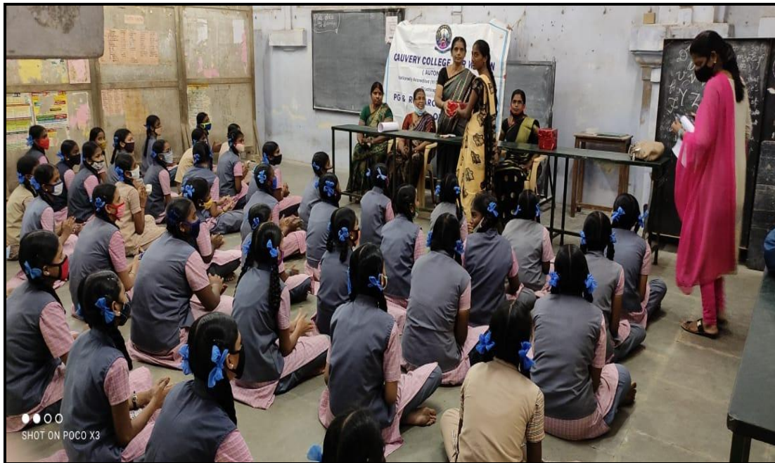
Mobile Addiction and need of wearing Mask in Covid -19 conducted on 13.03.2021 at Govt. Girls Higher Secondary School, Townhall, Trichy