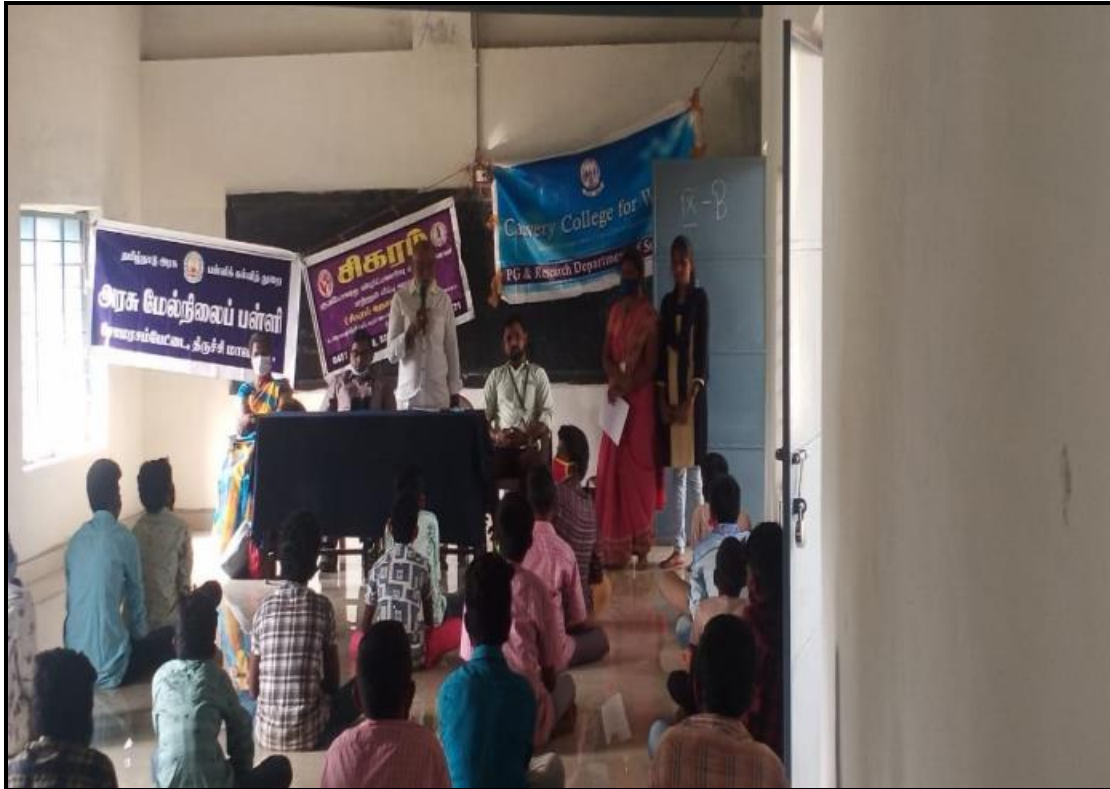
Health And Hygiene. Prevention For COVID And Immunity Development on 09.02.2021