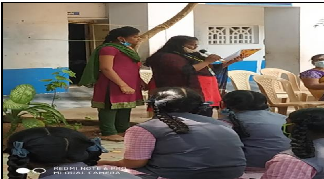
Awareness Programme on Lack of Confidence conducted on 18.03.2021 at Govt. Girls Higher Secondary School, Townhall, Trichy