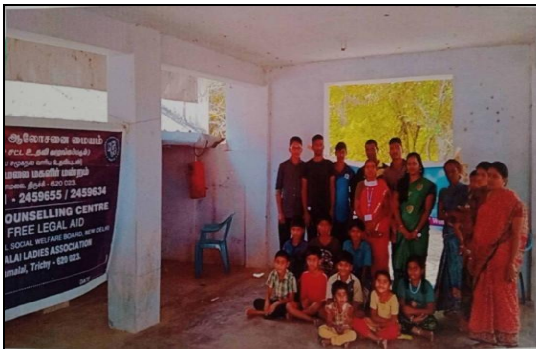
Awareness programme on Women Empowerment conducted on 09.11.2020